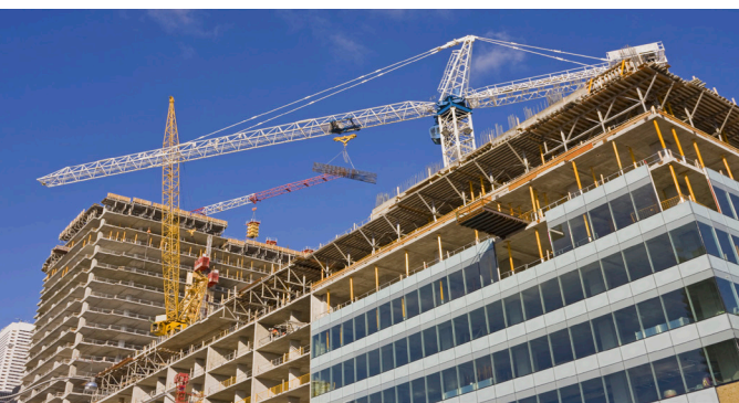
SERVICE AREA ENVIRONMENTAL